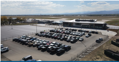
Terminal Construction Progress