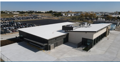
Completed site concrete